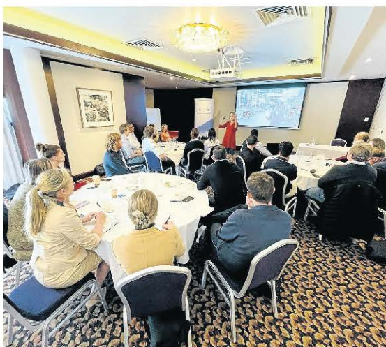
> A total of 26 delegates, including 13 from grower groups, boosted their public speaking skills at a workshop in August.

In a fun, supportive environment, many of the participants had the opportunity to take the stage to practice the skills and techniques they learned during the day. More details are available under the 'Activities' tab on gga.org.au