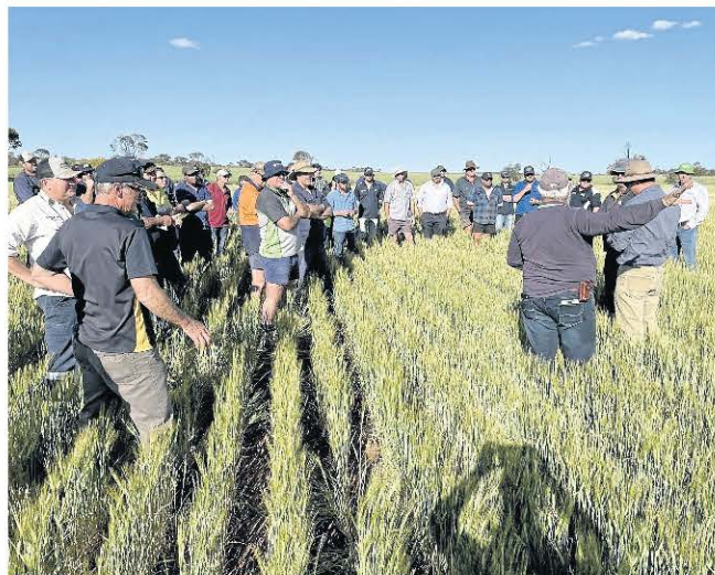
> Growers at the MADFIG pop-up field walk.

The pop-up walks were part of a GRDC-invested frost project being led by the GGA, with grower group partnerships being key to the facilitation process. More details are available under the 'Activities' tab at gga.org.au