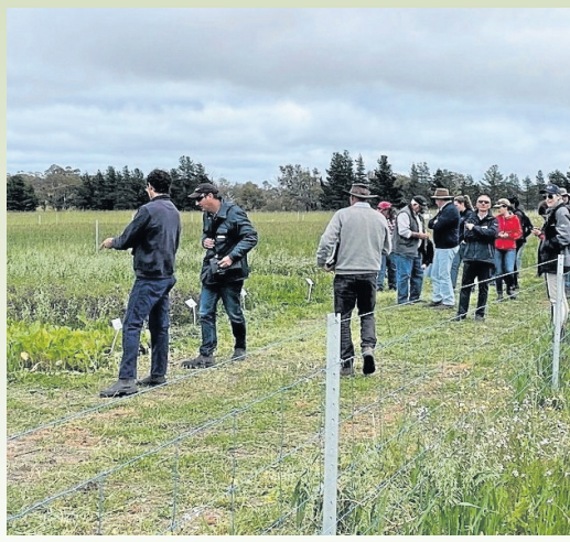
> Participants at the first Sheeplinks FEED365 field day at the Katanning Research Station.

The first project field day was held on October 13 at the Katanning Research Station. Small trial plots and larger grazing trials were on display, with a range of shrubs, perennial and annual grasses and legumes. More details are available under 'Activities' at gga.org.au