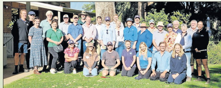
> Drought Hub study tour cohort at Cape Mentelle winery.

The tour facilitated fruitful discussions, ideas sharing, and the establishment of cross-hub relationships, laying the groundwork for future collaborations and knowledge exchange.