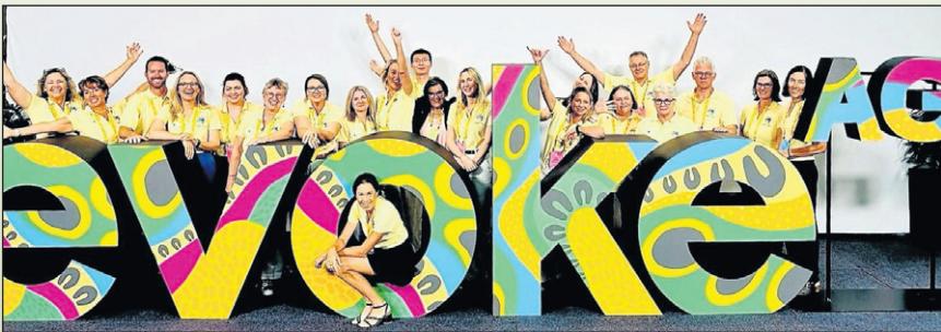
> Some of the GGA network delegation attending evokeAG held in Perth in February.

MORE than 20 local WA grower groups were joined by a NSW grower group, a SA grower group network, along with a grower group from Israel at the 'grower group exchange' experience during GGA's Lift Off event on Monday, February 19 which featured as a lead in side-event to evokeAG being held in Perth. Delegates built valuable new links and gained important operational updates from leaders from AgriFutures, Landcare Farming, GRDC, MLA and GGA teams. From Tuesday a delegation of more than 50 people from the GGA network attended evokeAG supported by discounted tickets negotiated by GGA for members. GGA also had a visible presence engaging with national and international delegates with an exhibition stand.