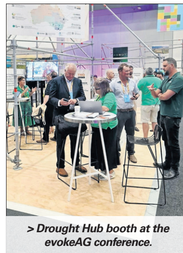
> Drought Hub booth at the evokeAG conference.

The Drought Resilience Adoption and Innovation Hubs are funded by the Australian Government's $5 billion Future Drought Fund program and aim to improve the drought resilience and preparedness of local farmers and their communities and foster agricultural innovation.