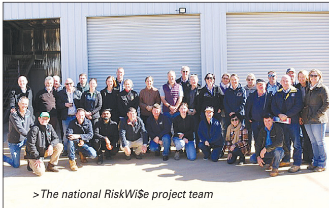
> The national RiskWiSe project team

Find out more and watch the project video at gga.org.au